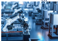
工业自动化 Industrial Automation