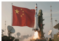
航空航天与国防 Aerospace & Defense