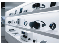
消费电子 Consumer Electronics