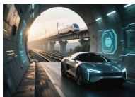
汽车电子 Auto Electronics