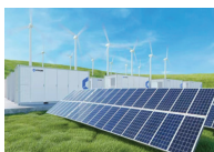
新能源 New Energy